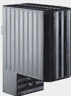
piccolo riscaldatore Touch-Safe serie CSK 060